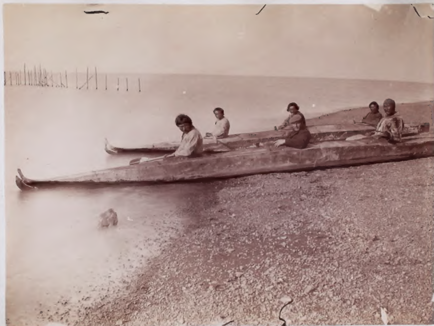
33. Bidarka Traveling, Ready to start.